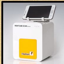
RIDA-CUBE Scan analyser -300 kr bl.a. for ethanol