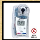
ATAGO smarte håndholdte refraktometer, acidimeter og pH-meter (NYHED) - topkvalitet