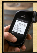
SENTIA analyser 250 kr