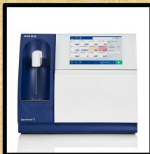
Oenofoss-2 FTIR analyser 400 kr (NYHED)