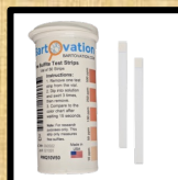
Accuvin/Bartovation Quicktest til eget brug for TA, MA, RS, FSO2 - 10-50 kr/test